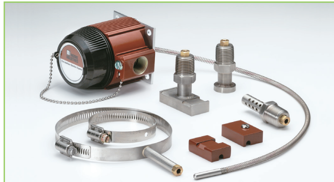
Figure 3. The WORM is available in Ready-to-install Assemblies for surface measurements.