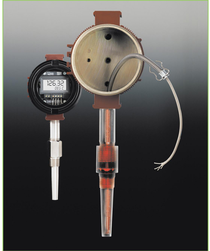
Figure 1. A flexible temperature sensor, such as the WORM, has many advantages including easy replacement during maintenance and minimal need for spares, because “one size fits all.”

“The WORM’s mission: To fit nearly everywhere, to be quickly cut to the correct length, and to reduce the number of spare parts a plant has to keep on hand.”